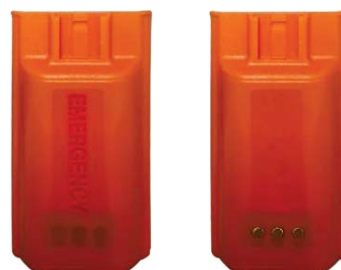
Battery Emergency / Rechargeable